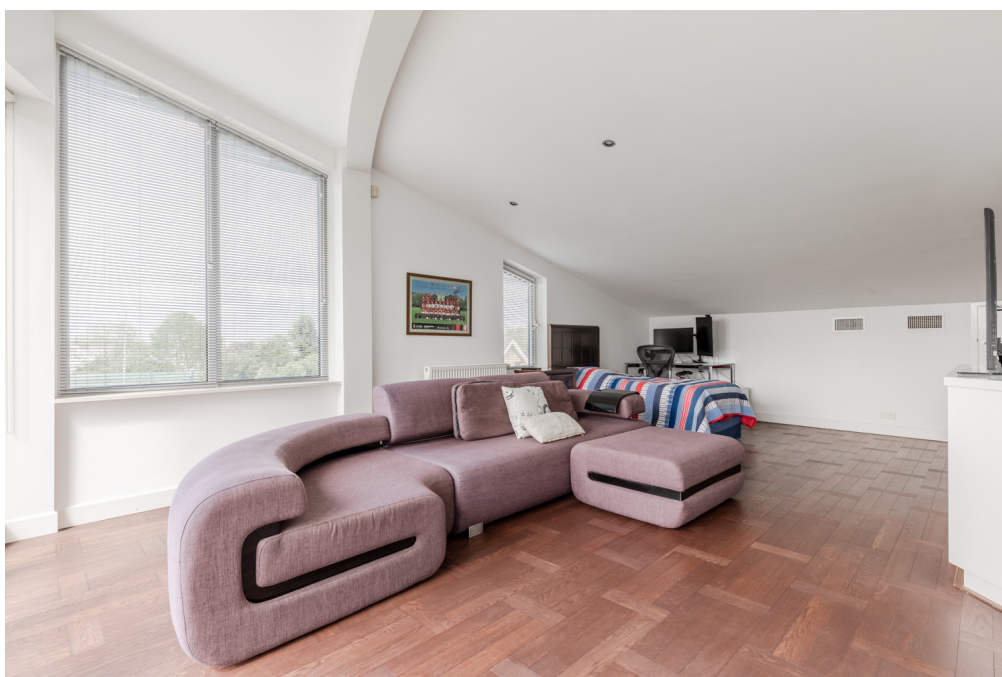
Tolheksbos 10 - Amstelveen Tweede Verdieping