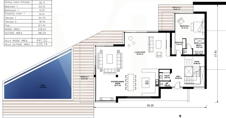
JARDINES DE IBERIS II. VILLA 9