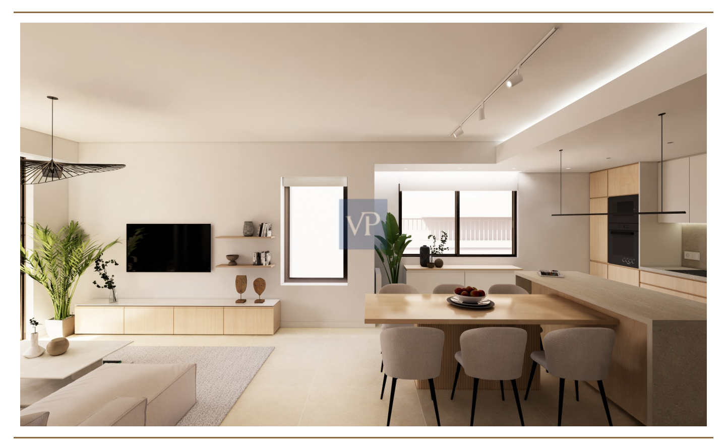
PRIX D'ACHAT: 410.000 EUR • SUPERFICIE DU TERRAIN: 173 m^2