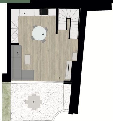
Piano Terra - Villetta 4