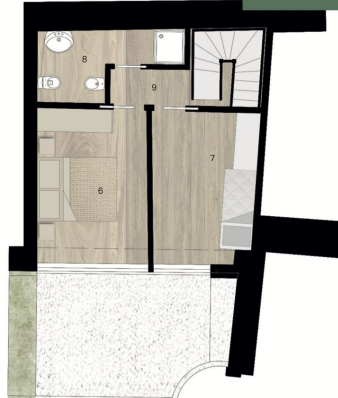
Piano Primo - Villetta 4