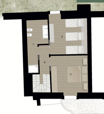
Piano Primo - Villetta 5