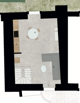
Piano Terra - Villetta 5