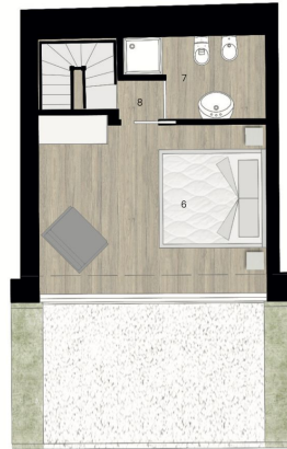
Piano Primo - Villetta 2

LEGENDA 6. camera matrimoniale 7. bagno 8. corridoio