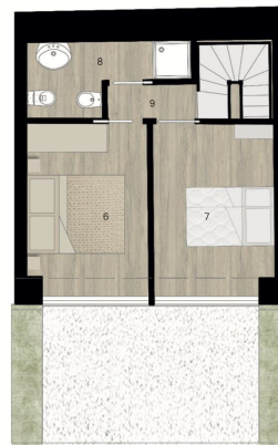
Piano Primo - Villetta 3

LEGENDA 6. camera matrimoniale 7. seconda camera da letto 8. bagno 9. corridoio