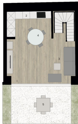
Piano Terra - Villetta 3

LEGENDA 1. ingresso 2. cucina 3. soggiorno 4. area pranzo 5. parking esterno