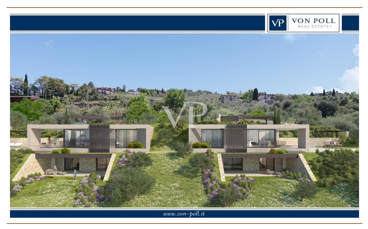
LIVING SPACE: ca. 196 m^2\, • ROOMS: 7 • LAND AREA: 400 m^2