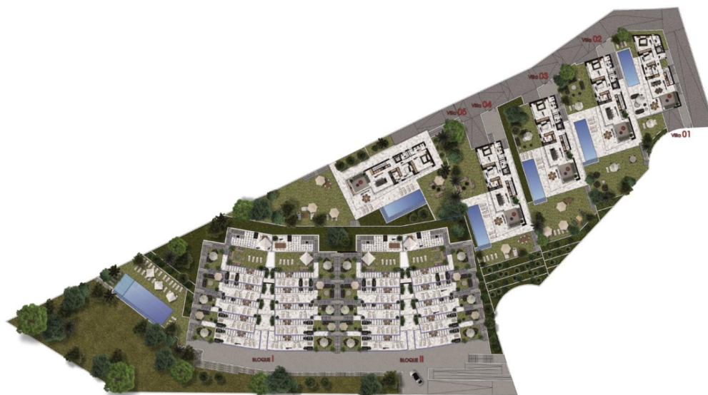
PLANTA GENERAL (1/500)