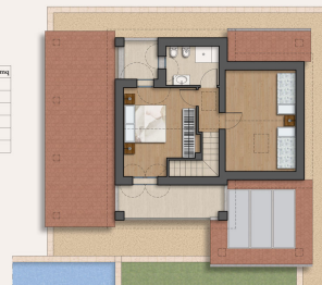
PIANTA PIANO PRIMO Scala 1:100

This floor plan is not to scale. The documents were given to us by the client. For this reason, we cannot guarantee the accuracy of the information.