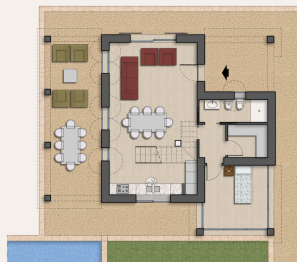
PIANTA PIANO TERRA Scala 1:100