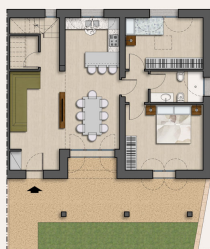
PIANTA PIANO TERRA Sca. 1:100