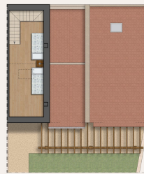
PIANTA PIANO TERRA Sca. 1:100