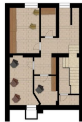
PIANTA PIANO SEMINTERRATO