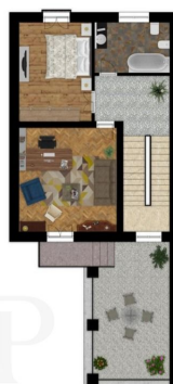
PIANTA PIANO PRIMO