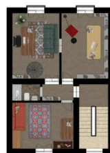
PIANTA PIANO SECONDO