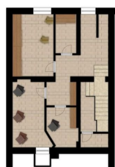
PIANTA PIANO SEMINTERRATO