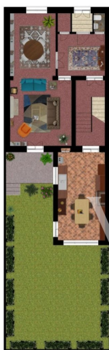
PIANTA PIANO TERRA