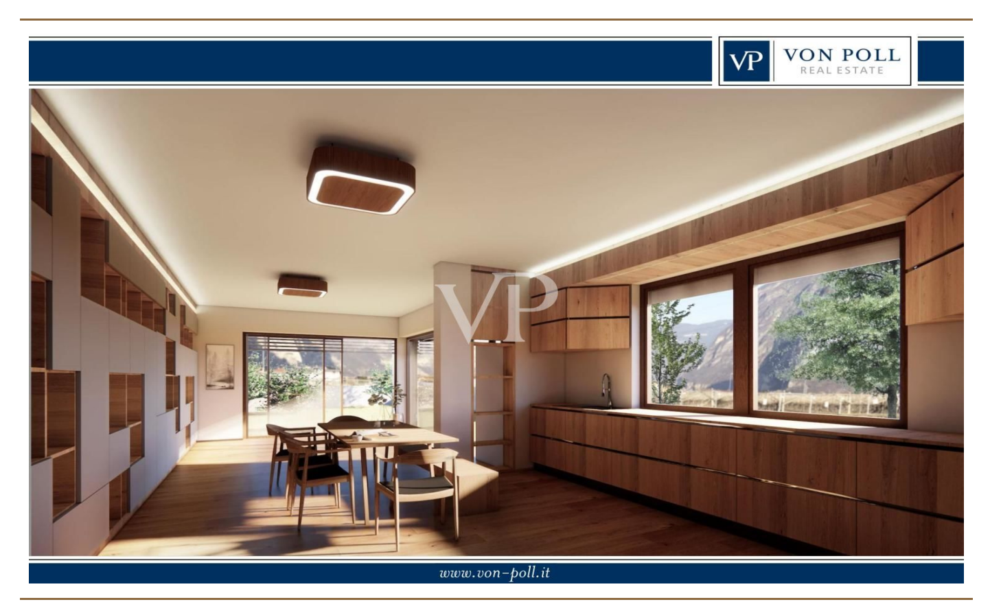
PURCHASE PRICE: 510.000 EUR • ROOMS: 3