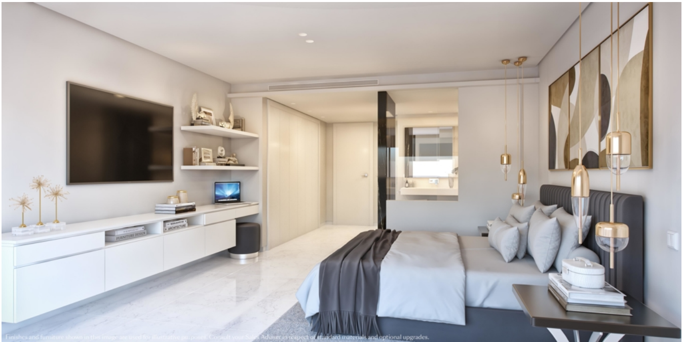
Finishes and furniture shown in the image are used for illustrative purposes. Consult your Sales Advisor in respect of standard materials and optional upgrades.