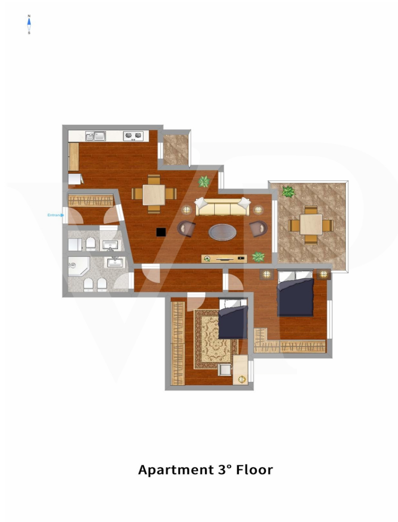
Apartment 3° Floor

This floor plan is not to scale. The documents were given to us by the client. For this reason, we cannot guarantee the accuracy of the information.