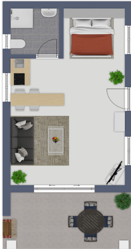
Exposéplan, nicht maßstäblich