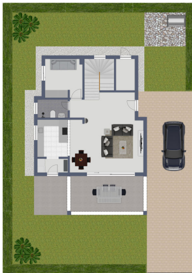
Exposplan, nicht maßstäblich