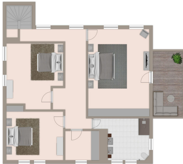
Exposéplan, nicht maßstäblich

This floor plan is not to scale. The documents were given to us by the client. For this reason, we cannot guarantee the accuracy of the information.