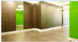
Level +4 Entrance