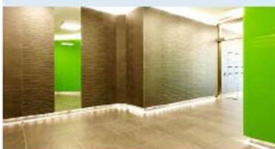
Level +4 Entrance