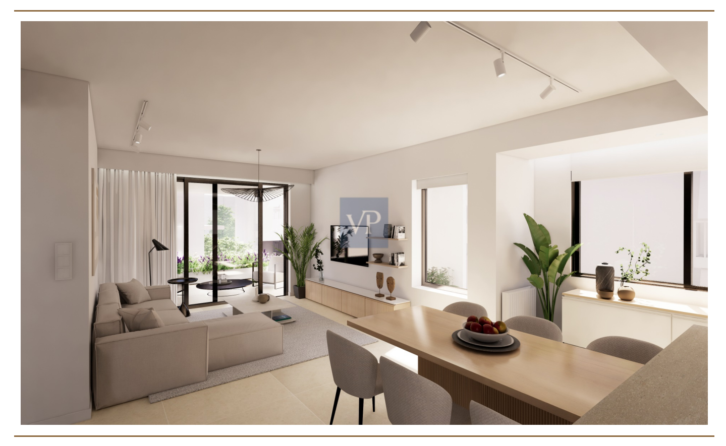
KAUFPREIS: 467.000 EUR • GRUNDSTÜCK: 173 m<sup>2</sup>