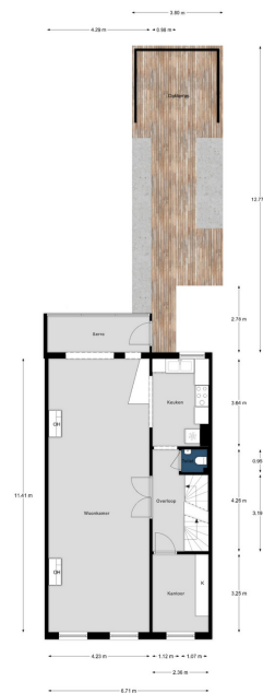
Alphenstraat 60, Den Haag | 1e Verdieping H = 3,13 m