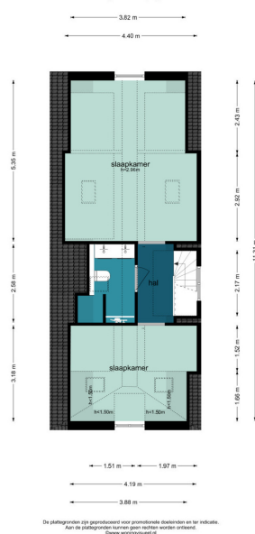
Tweede Jan van der Heijdenstraat 57-4 - Amsterdam Vijfde Verdieping

De plattegronden zijn geprojecteerd voor grondrekte dwarskanten en ter indicatie. Aan de plattegronden kunnen geen rechten worden ontleend. Zie: www.vonpoll.nl